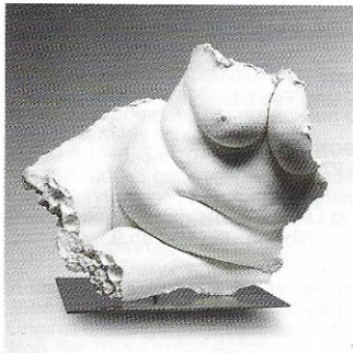
Nicole Farhi 'Cybele'