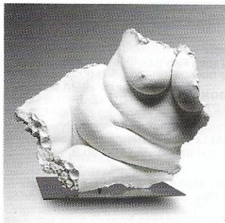
Nicole Farhi 'Cybele'