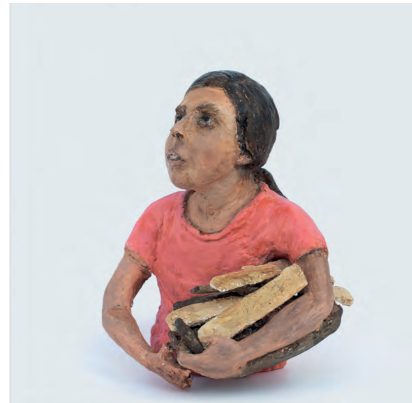
Above: Girls from Nicole Farhi's Children of Gaza series, 2025