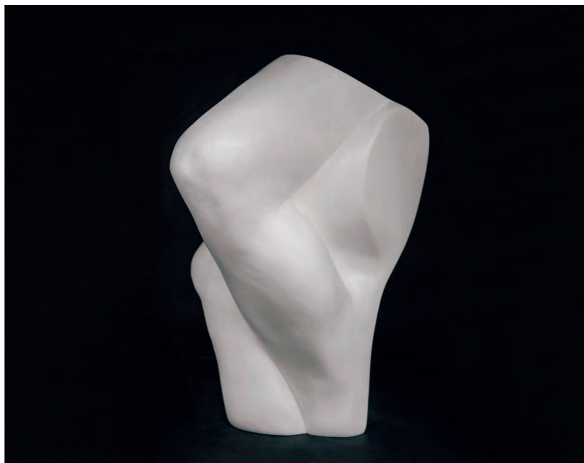
Nicole Farhi's sculptures, Virevolte and Pile ou Face , from the series Shapeshifting , shown at the 'Second Lives' exhibition, 2025