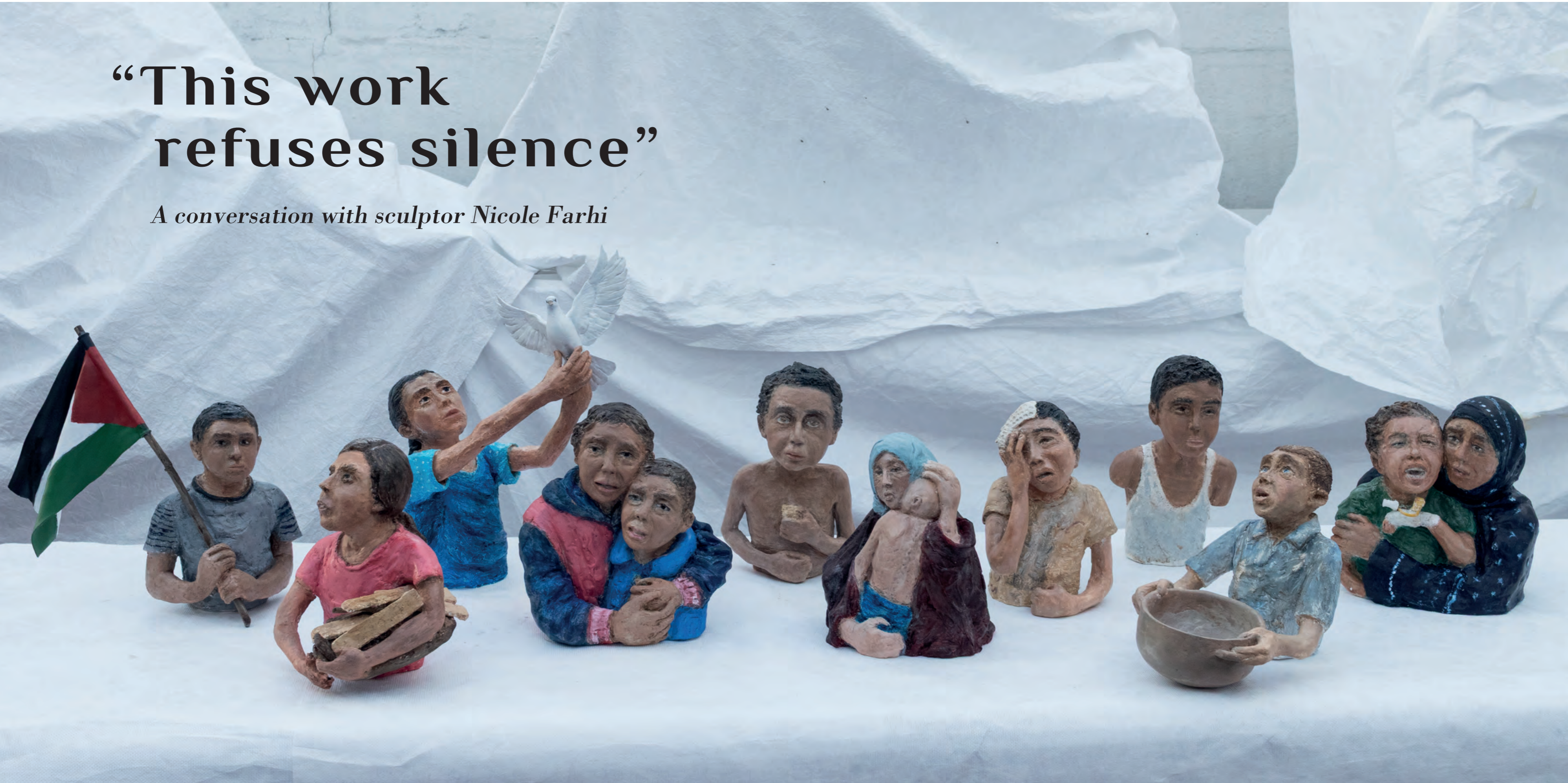
Above: Nicole Farhi's Children of Gaza series, 2025

A conversation with sculptor Nicole Farhi